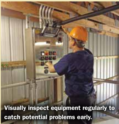
Visually inspect equipment regularly to catch potential problems early.