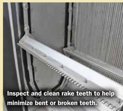
Inspect and clean rake teeth to help minimize bent or broken teeth.